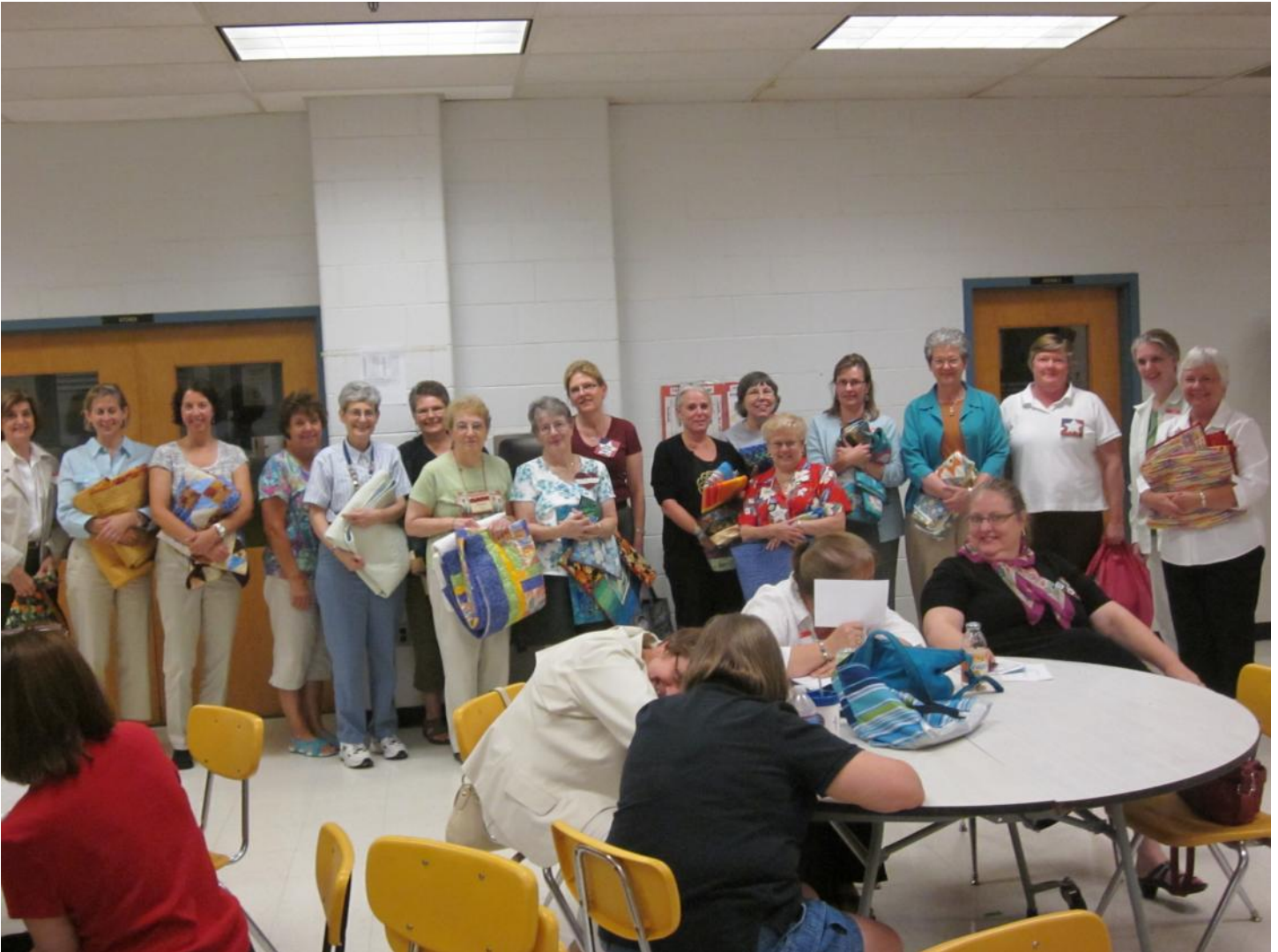
Look at all the Show and Tell!!!

Bring your “show and tell” items to the next meeting so we can see what everyone is working on. Your efforts motivate others to try new challenges, finish their UFOs and improve their skills through the use of new colors and patterns.