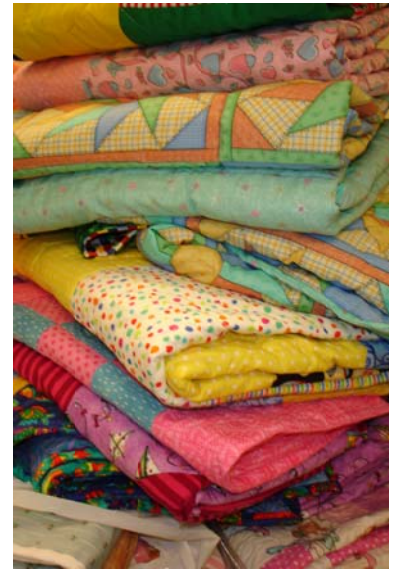
CQU members donated many quilts to be taken to Louisiana.