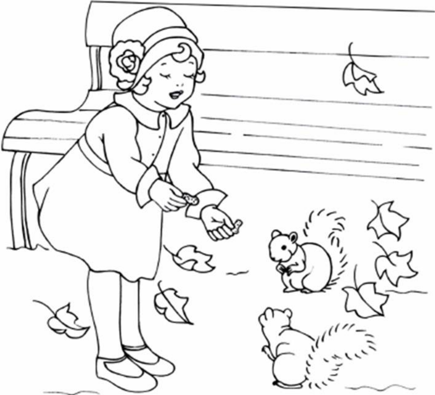
FEEDING THE SQUIRRELS

Here's a sample redwork pattern with a September theme that you can trace onto Muslin and stitch into a quilt! Enjoy!